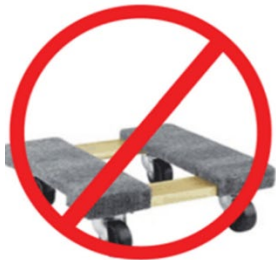
Four wheel dollies